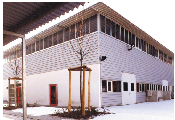
New building of an in-situ training yard